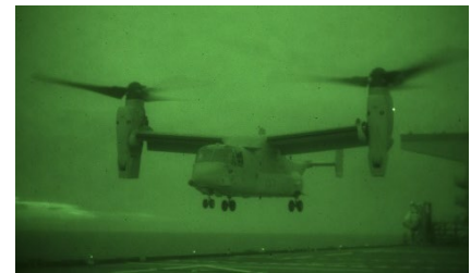
Pictured: MV-22 conducts LLL Boat Ops

any and all future challenges by training, working, and fighting as a team. Welcome to the starting Line Up!