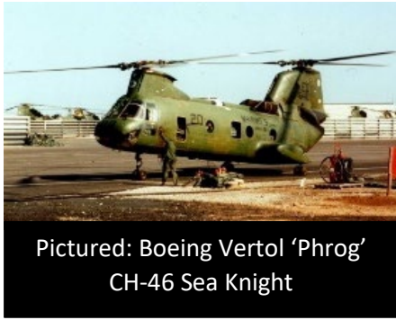
Pictured: Boeing Vertol 'Phrog' CH-46 Sea Knight

was again there to execute our nation's bidding overseas. While attached to the 4th Marine Expeditionary Brigade (4th MEB), the squadron conducted a non-combatant evacuation operation of the U.S. Embassy in Mogadishu, Somalia ( Operation Eastern Exit ) just prior to the events depicted in "Black Hawk Down."