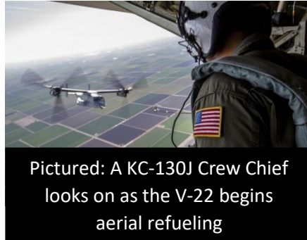
Pictured: A KC-130J Crew Chief looks on as the V-22 begins aerial refueling

down on June 3, 2005 to transition to the MV-22 Osprey . HMM-263 was re-designated Marine Medium Tiltrotor Squadron (VMM-263) and reactivated March 3, 2006 as the first operational MV-22 squadron. On September 17, 2007, VMM-263 deployed with ten Ospreys in support of Operation Iraqi Freedom, during which it conducted the first combat raid utilizing MV-22s. The squadron then became the first MV-22