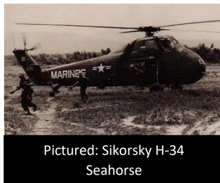
Pictured: Sikorsky H-34 Seahorse

home based for the next eleven years. During this time period the “Thunder Chickens” were honing their skills through numerous deployments and countless training exercises around the globe. The squadron was then re-designated Marine Medium Helicopter Squadron (HMM-263) and transitioned to the new Sikorsky H-34 Sea Horse. The squadron utilized their new aircraft for multiple deployments including the large-scale American response to the Soviet Union’s deployment of intercontinental ballistic missiles to Cuba , the “Cuban Missile Crisis”.